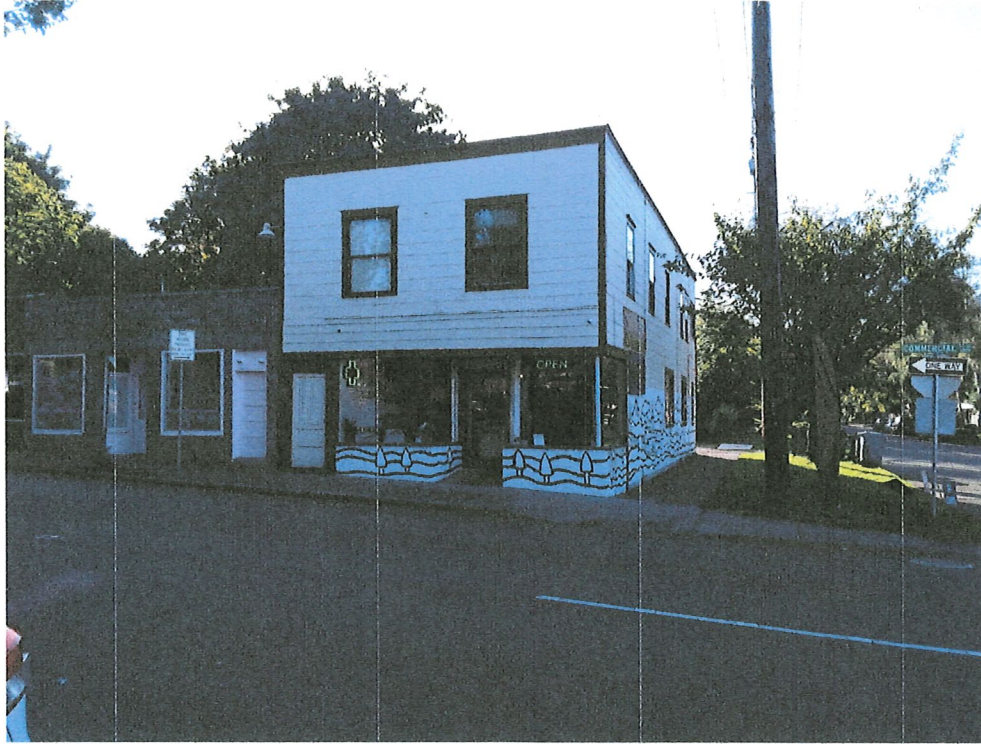
Front of Building Commercial St facing