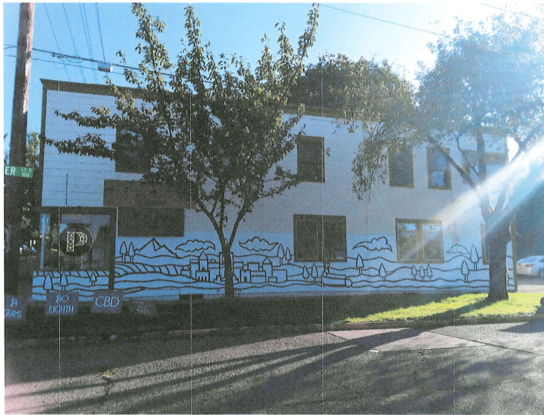
Side of building Miller St facing