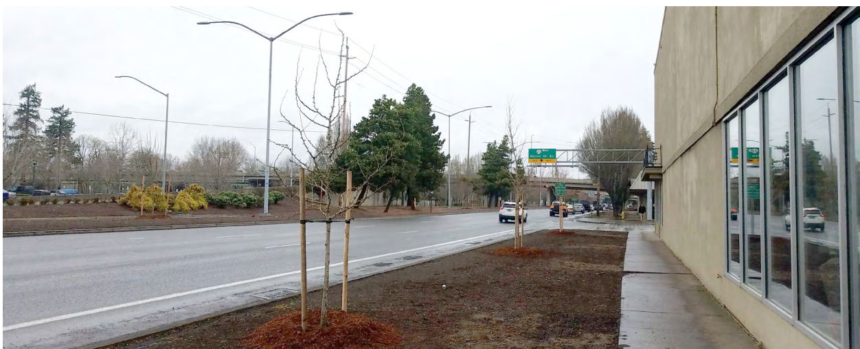
Figure 8: New Street Trees Planted Along the East Side of Front Street and the Median.

Treecology is on contract through 2022 to continue with street and right-of-way tree planting.