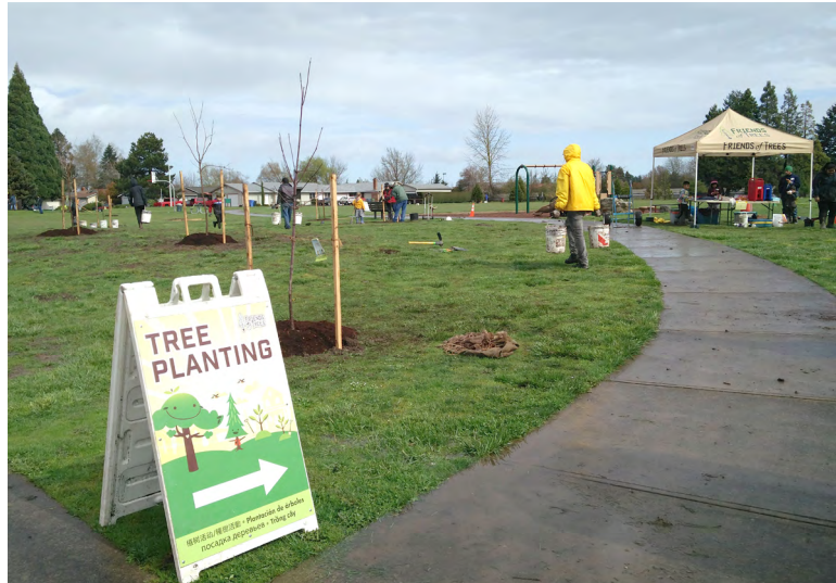
Figure 3: 2019 Arbor Day Planting at Bill Riegel Park

Arbor Day in the US was started in Nebraska in 1872 “to inspire people to plant, nurture, and celebrate trees.” Each year, Salem hosts an Arbor Day tree planting event for community volunteers that improves Salem’s urban tree canopy. In recent years,