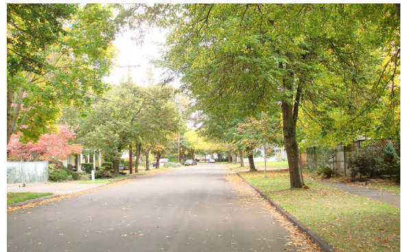
Figure 2: Street Trees Provide Many Aesthetic Benefits

Our Urban Forestry program within the Parks Operations Division maintains, removes, and plants trees along our city streets, in public parks, and in other City properties. Contracts with non-profits and contractors such as "Friends of Trees" and "Treecology" expand our planting capacity while also providing outreach, education, and volunteer opportunities.