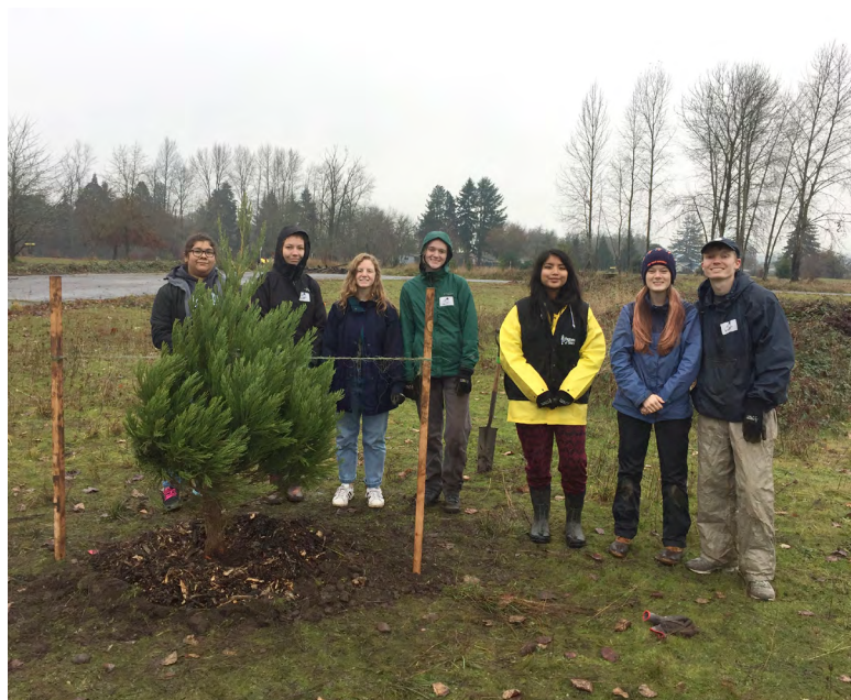
Figure 7: A Newly Planted Tree in Cascades Gateway Park.

Friends of Trees volunteers planted 172 large stock trees in 2019 in Salem. Friends of Trees planted an additional 5645 small stock trees, shrubs, and smaller plants in Salem parks and natural areas.