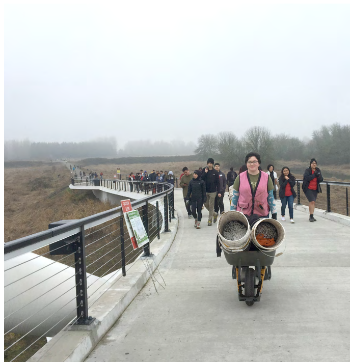
Figure 6: Tree Planting Volunteers at Minto-Brown Island Park