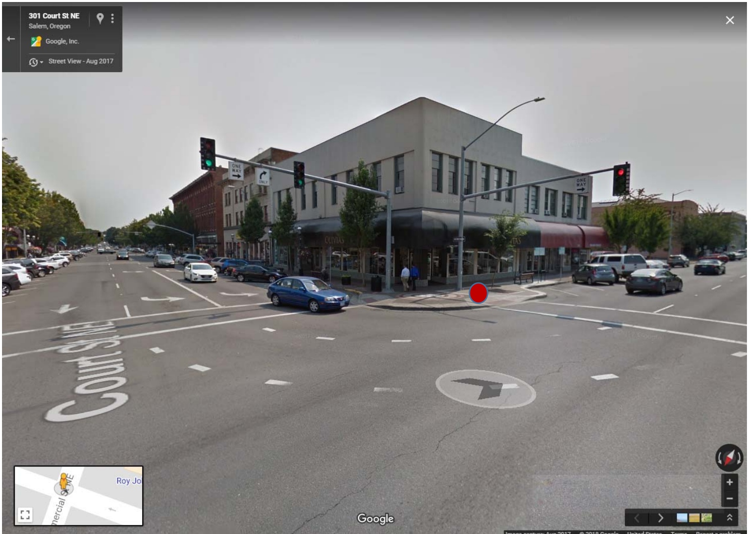
Location #2: Art Pedestal, located in Downtown Salem at corner of Commercial and Court Streets