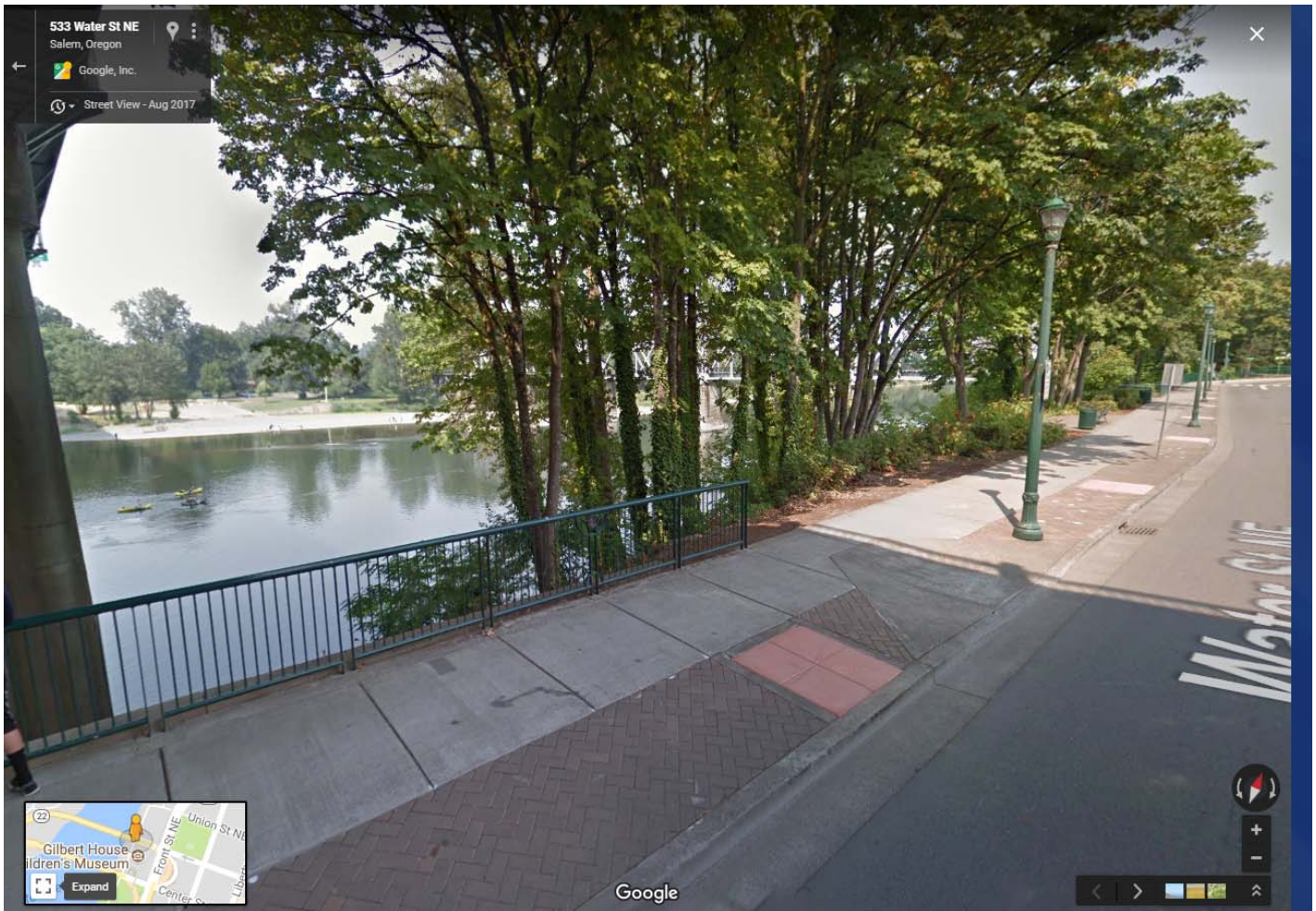
Location #1: Riverfront Park Promenade, Water Street between Riverfront Park and Union Street Railroad Bridge