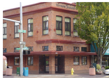
Vernon Jewelers, 405 Court St. NE After