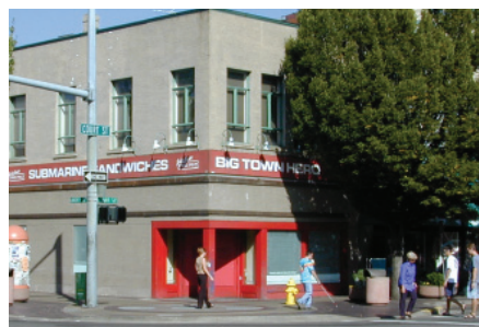
Vernon Jewelers, 405 Court St. NE Before

Learn more about the terms, guidelines, and eligible uses by going to www.cityofsalem.net/business-resources .