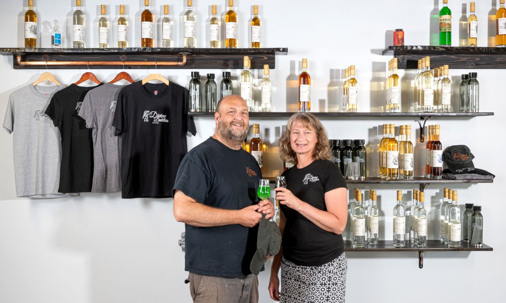
Divine Distillers Small craft distillery utilizing locally-sourced ingredients