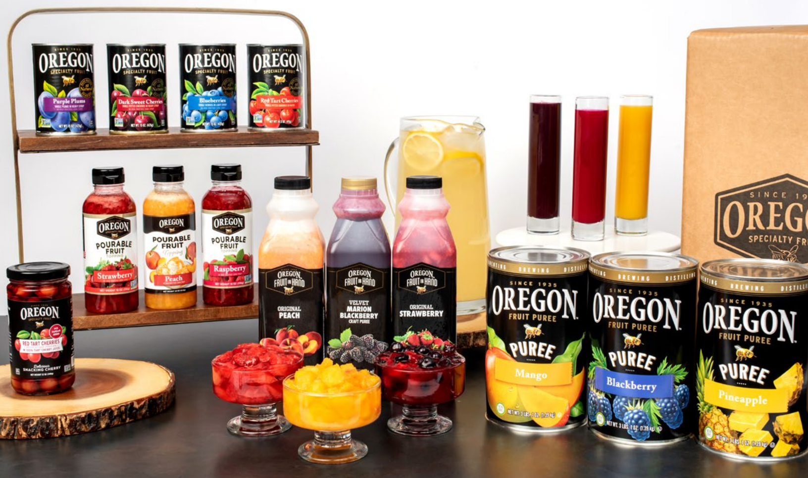
OREGON FRUIT PRODUCTS Leading producer of fruit solutions