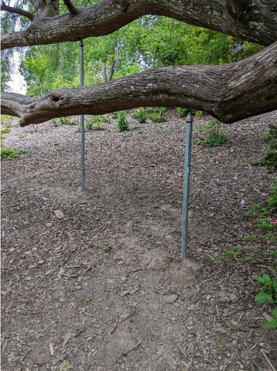
Two new structures prop the long horizontal limbs of this Montezuma cypress.