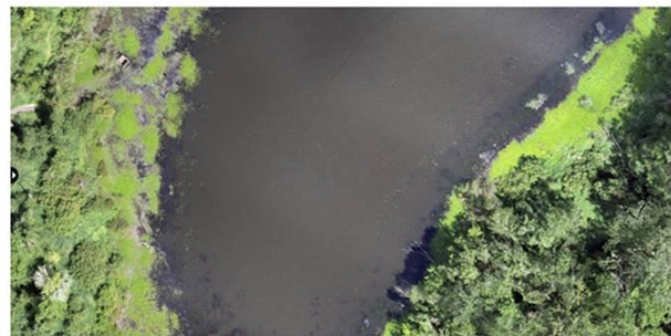
Willamette Slough July 2021

As with the past two summers, we will be contracting with IRM, an experienced habitat restoration company that employs state-licensed herbicide applicators, to treat the invasive plants with an aquatic-approved herbicide. To ensure efficient application, a blue-green dye is added to the herbicide, allowing IRM staff to see where the herbicide is applied. Use of the area will be restricted during the treatment window and for 24 hours after application; however, the blue-green dye may remain visible longer.