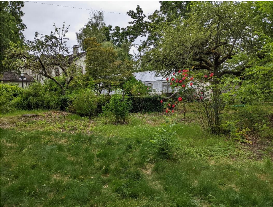
A view (facing North) of the area for the proposed Woodland Garden. Bush House and the Bush Conservatory are in the background.