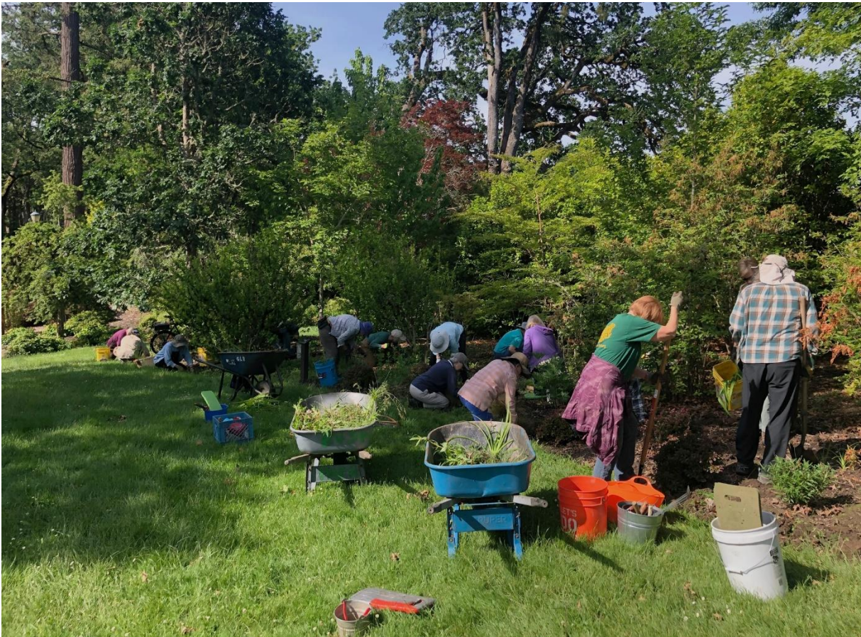
Volunteers in the weeding brigade at Bush's Pasture Park.