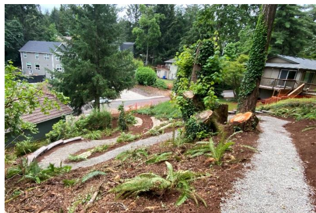
New trail section under development at northeast corner of Sprague High School Property, approaching Joplin Court S

The trail is frequented by joggers, dog walkers, bird watchers, hikers, and mountain bikers. Trailhead access is located in front of Sprague High School near Kuebler Road S.