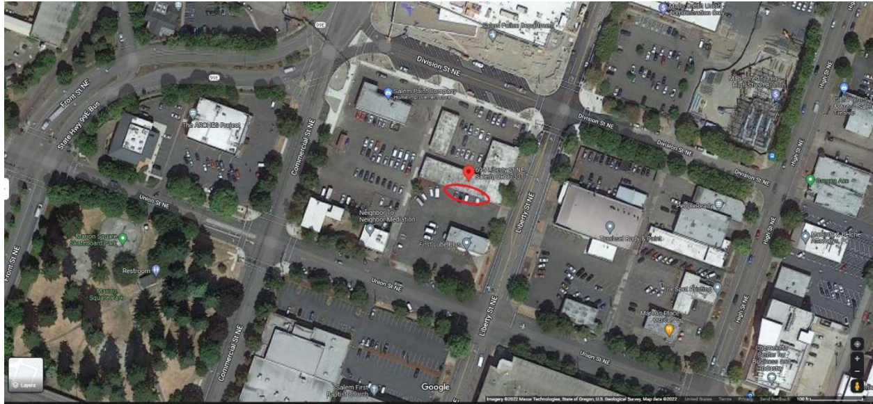
Figure 1 - Google aerial view of building and property at 695 Liberty St NE, Salem, OR 97301