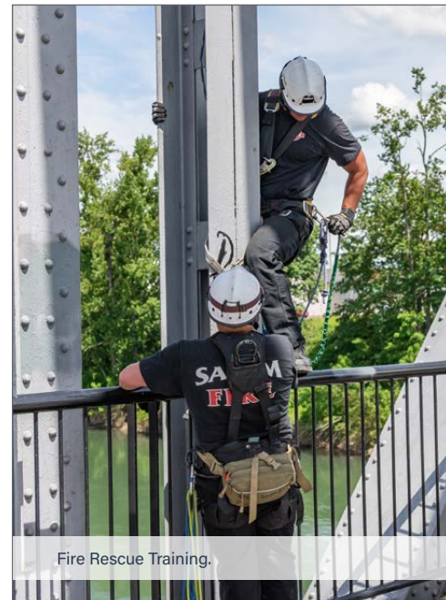
Fire Rescue Training.

Public safety is a critical function of local government. In Salem, our 9-1-1 call center sends Police, Fire, and emergency medical services to those in need and keeps Salem safe by protecting residents, visitors, and properties from harm in the event of a natural disaster or other emergency. In addition to responding directly, we plan and prepare our community for situations that may threaten health or safety. Salem also has a Municipal Court, responsible for protecting the rights of individuals and prosecuting crimes that impact the quality of life in Salem.