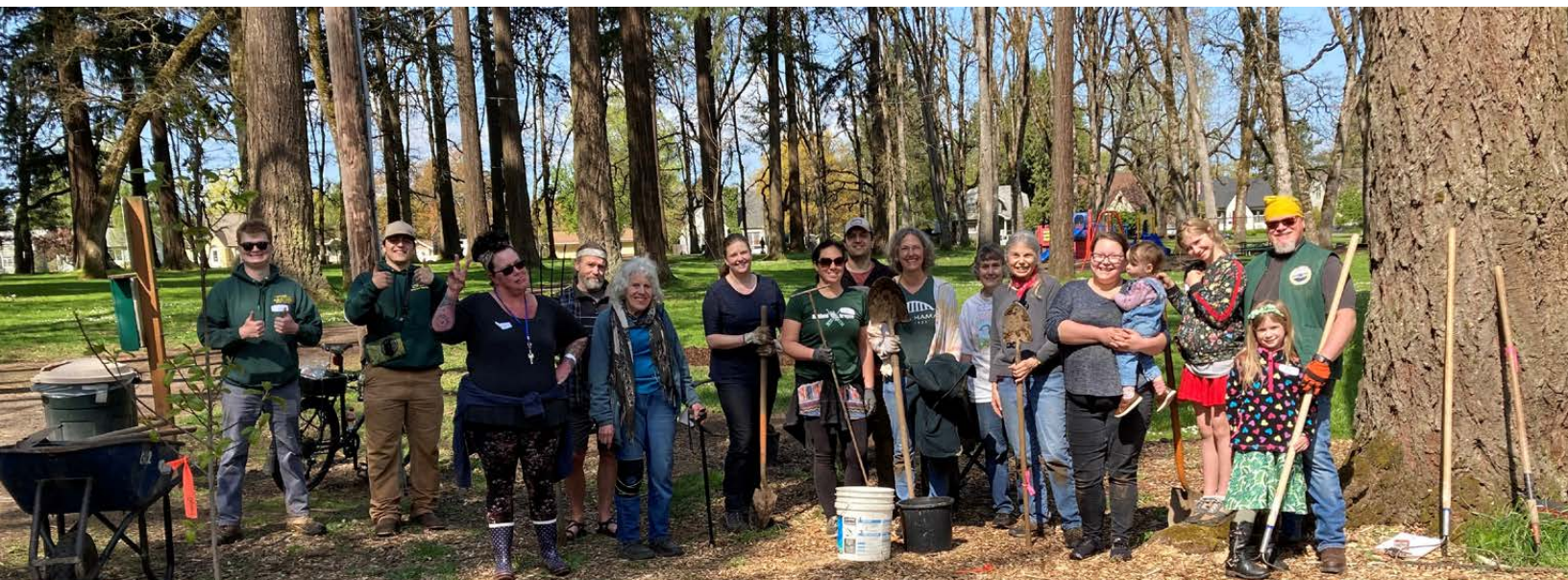
Volunteers at Englewood Park..