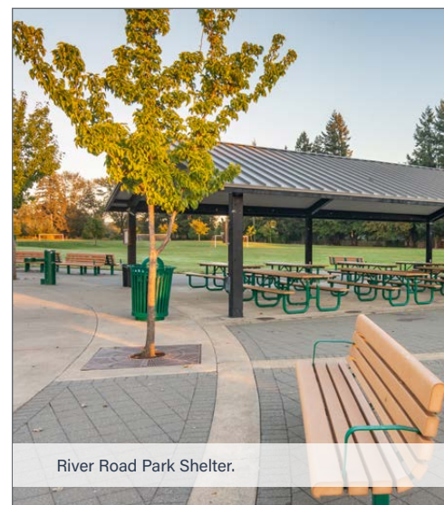
River Road Park Shelter.

To ensure Salem residents have access to parks, recreation, and historic and cultural opportunities, we're actively working with our community today to build a long-term vision for future growth and development. We also work with the private and non-profit sectors to develop a diverse range of housing options. Together, we create and maintain public spaces to offer activities that connect, benefit, and reflect our community, and support the arts, historically, and culturally significant buildings and sites, and community events.