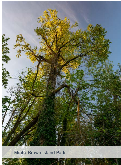
Minto-Brown Island Park.