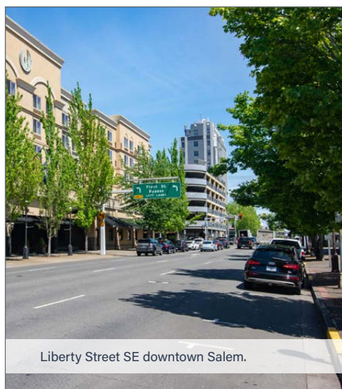
Liberty Street SE downtown Salem.