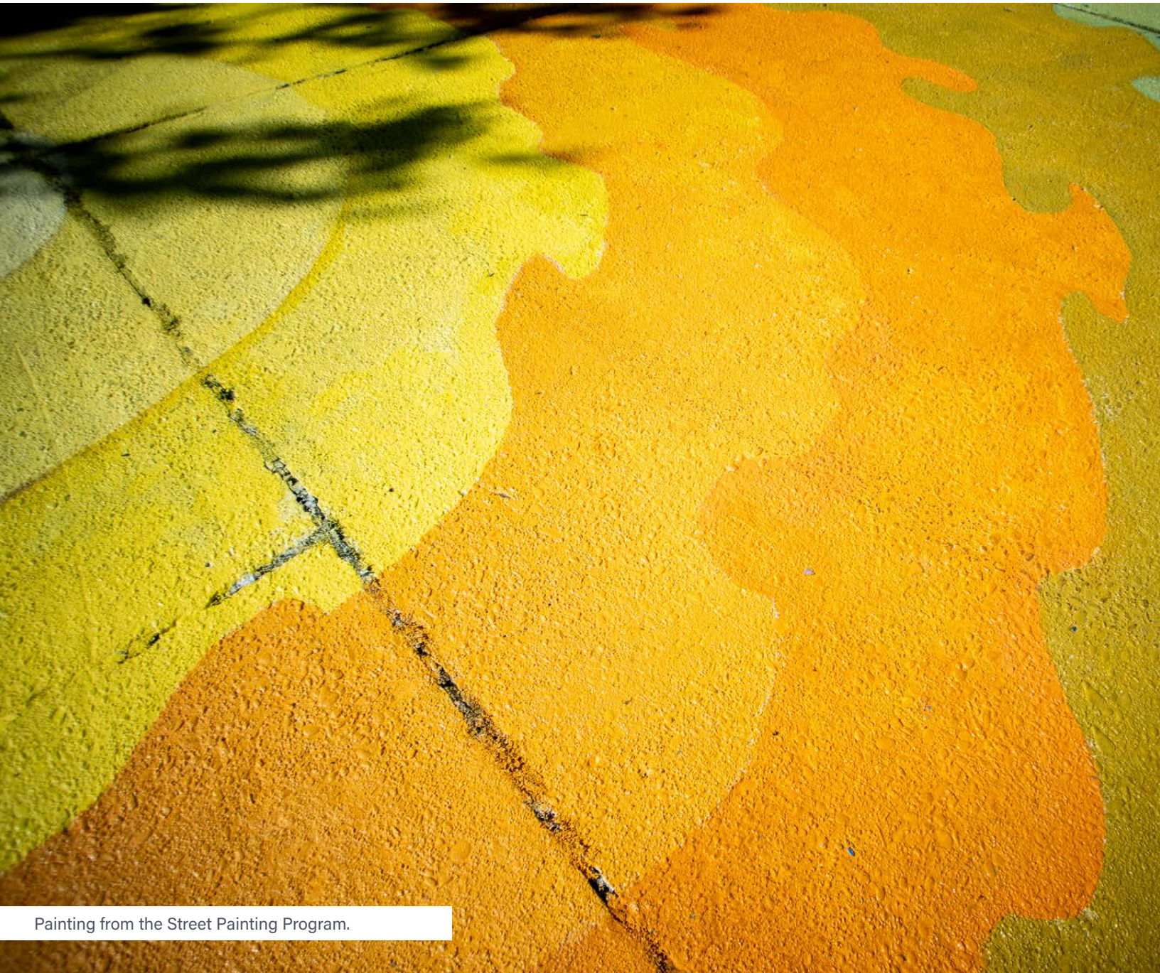
Painting from the Street Painting Program.