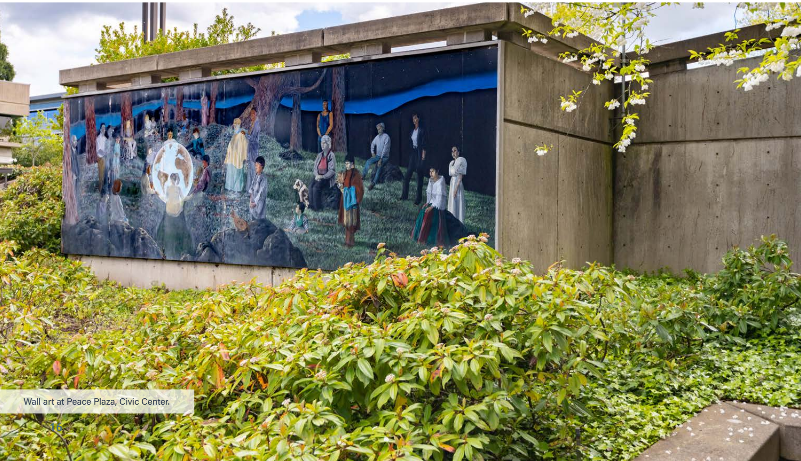
Wall art at Peace Plaza, Civic Center.

Sustaining infrastructure and services. Actions taken by Salem's City Council helped speed the City's recovery from the 2008 recession. Strengthening the City's long-term financial position to ensure ongoing provision of core services to all residents has remained at the forefront of City Council priorities since that time. In addition to concerns about funding day-to-day operations, voters approved the 2022 Community Improvement Bond to fund pressing needs for fire engines and equipment, for improvements to streets and sidewalks, for parks, for affordable housing and shelter, and other projects to improve the community.