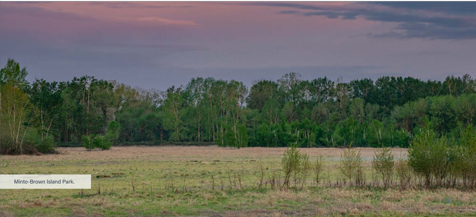
Minto-Brown Island Park.