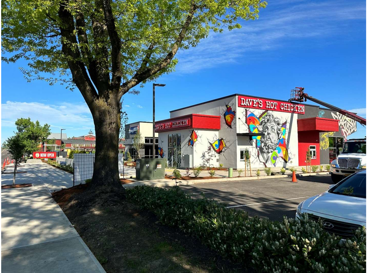
Figure 3 – Photo taken from sidewalk along Center St NE looking northwest toward the building at 3817 Center St NE, Salem, OR 97301.