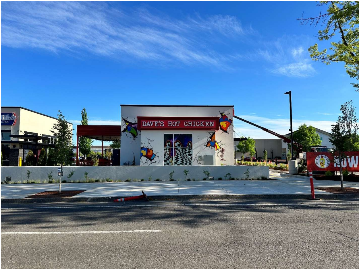
Figure 2 - Photo taken from travel lane on Center St NE looking north to building at 3817 Center St NE, Salem, OR 97301.