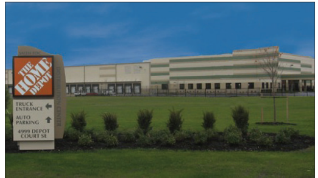
The Home Depot Rapid Deployment Center