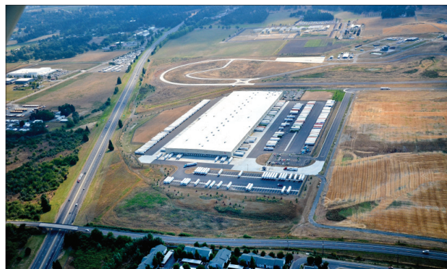
Aerial of Mill Creek Industrial Park