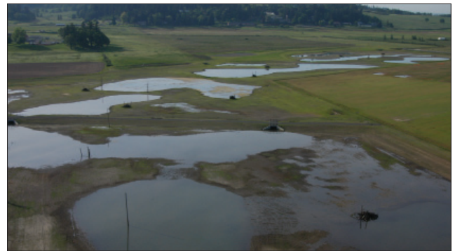
Mill Creek Wetlands