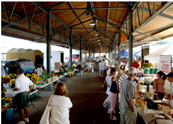
Rochester Public Market in Rochester, NY.

A public market is typically a year-round, permanent facility where local businesses sell food or craft items. Public markets take a variety of forms; each market is a unique reflection of its city and neighborhood. If located in the Portland Road area, such a concept could support small businesses, help to revitalize the Corridor, and expand food access. Other projects that could meet the goals of a public market could include a food hall, commercial condominiums organized around a common space.