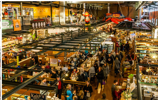
Milwaukee Public Market in Milwaukee, WI.