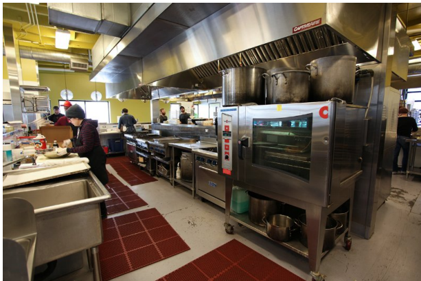
Kitchen Cru in Portland, OR.

Business incubators nurture the development of new companies, helping them survive and grow during the startup period when they are most vulnerable. Incubator programs provide client companies with a range of services, including access to production facilities, business support services, and other resources tailored to young firms. This report considers stand-alone commercial kitchens (without auxiliary services) as an additional business concept.