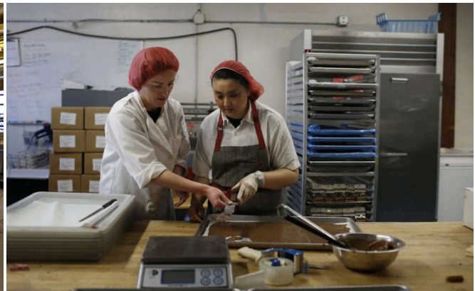
La Cocina, San Francisco.