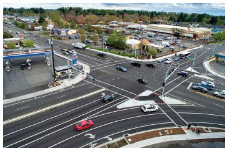
Glen Creek Intersection Aerial