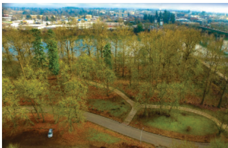
Wallace Marine Park Trail