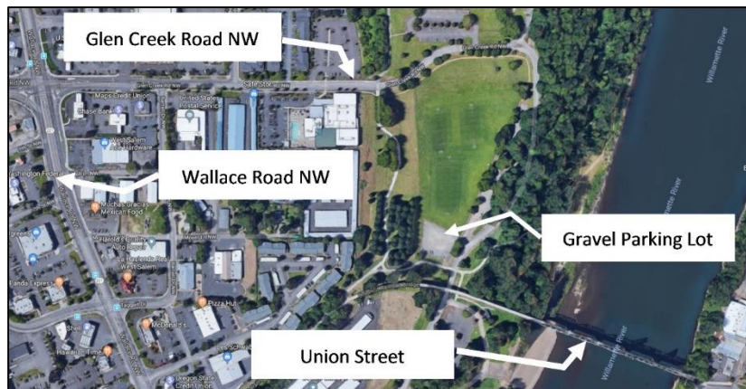
Potential location of park and shuttle/bike/walk lot in Wallace Marine Park

recommendation is to reduce vehicular traffic crossing the Willamette River by providing an opportunity for people to walk or bike to work from Wallace Marine Park. The proposal of the Task Force focused on the gravel parking lot at the base of the Union Street Railroad Bridge. This parking area is closest to the walkway leading to and from the Union Street Bridge. If paved and striped, this lot could