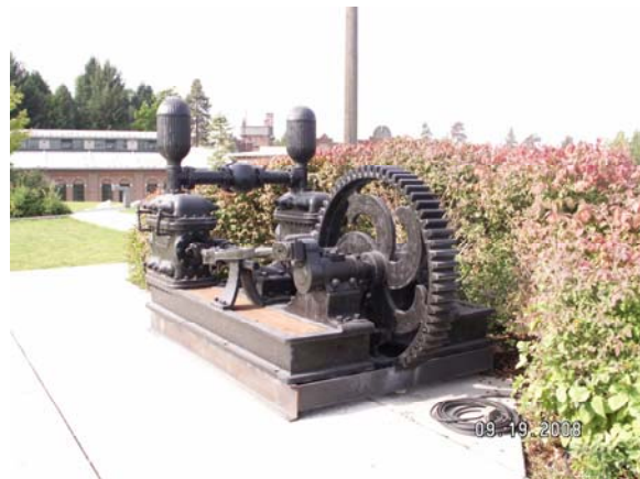
Times require new equipment & new ideas

Monitoring progress is particularly important when the goals are significant and the timeframes long. To get the most efficient processes, it is important to measure results, learn from others and adapt along the way. Committing to continuously improve in all policy and process helps assure good stewardship and facilitates achievement of goals. For these reasons, we recommend that the City: