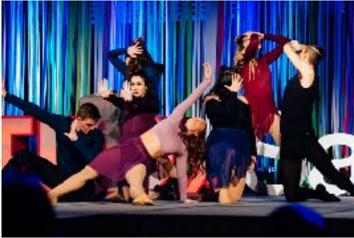
(upper left) Tippy Toe Dance Studio created a special performance.