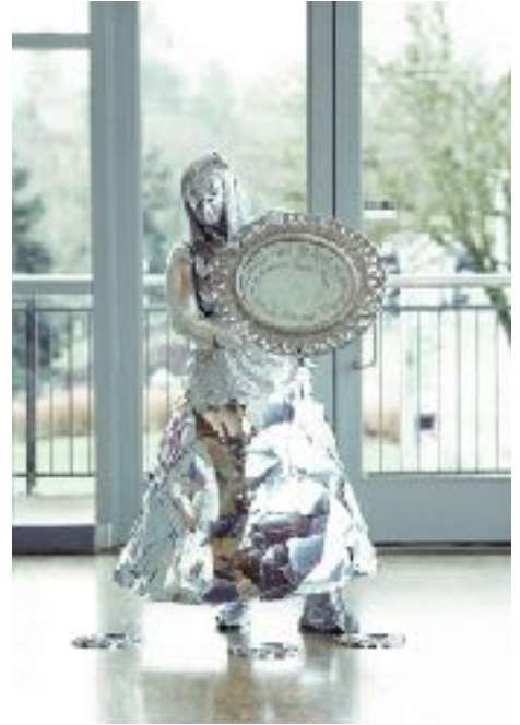
(right) We had a living statue that encouraged people to ponder “Through the Looking Glass”