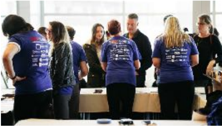
(left lower) Volunteers register attendees and distribute name tags and swag bags.