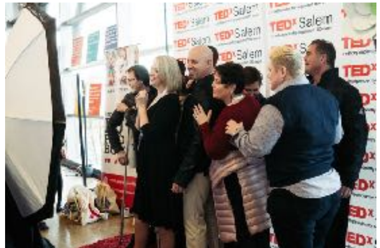
Recess Activities: Virtual reality (upper left), coffee break & social media wall (upper right), guided conversations (lower left), photo booth (lower right)