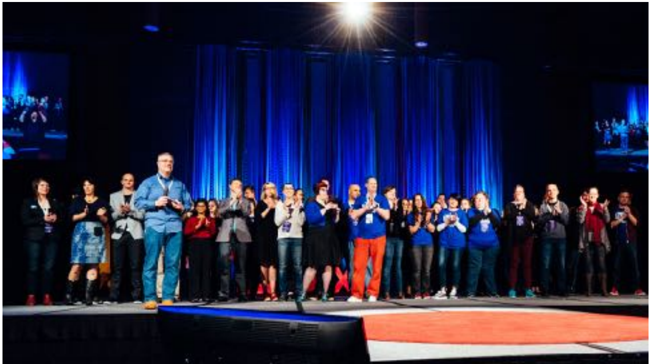
Last photo of the day: The volunteers who make TEDxSalem happen from organizing, coaching and speaking to running the day of activities.