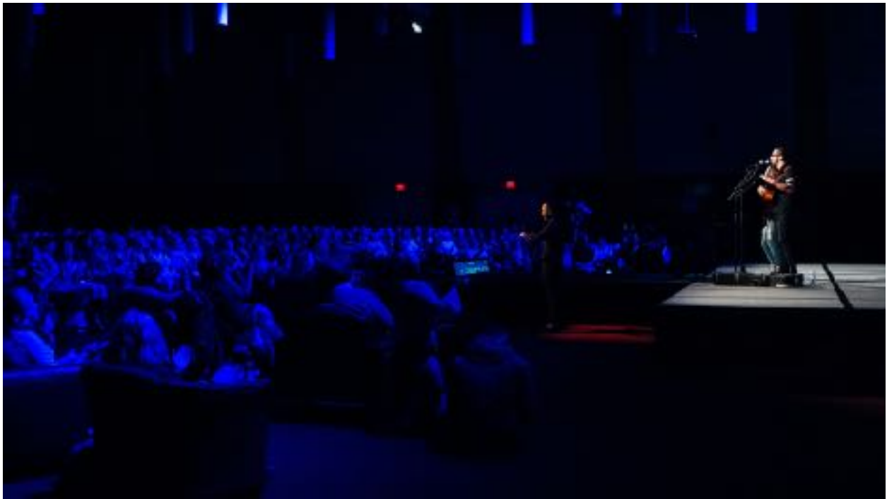
Audience and stage shot of Stereo RV performing.