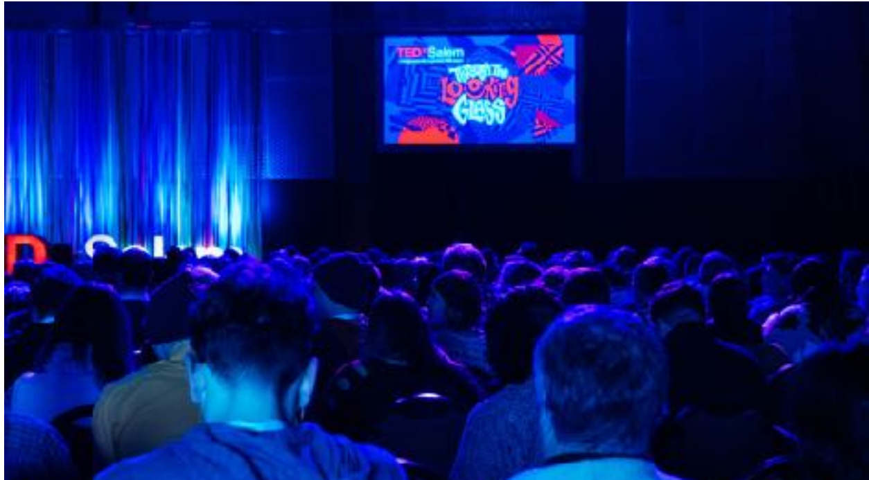
Audience and atmosphere.